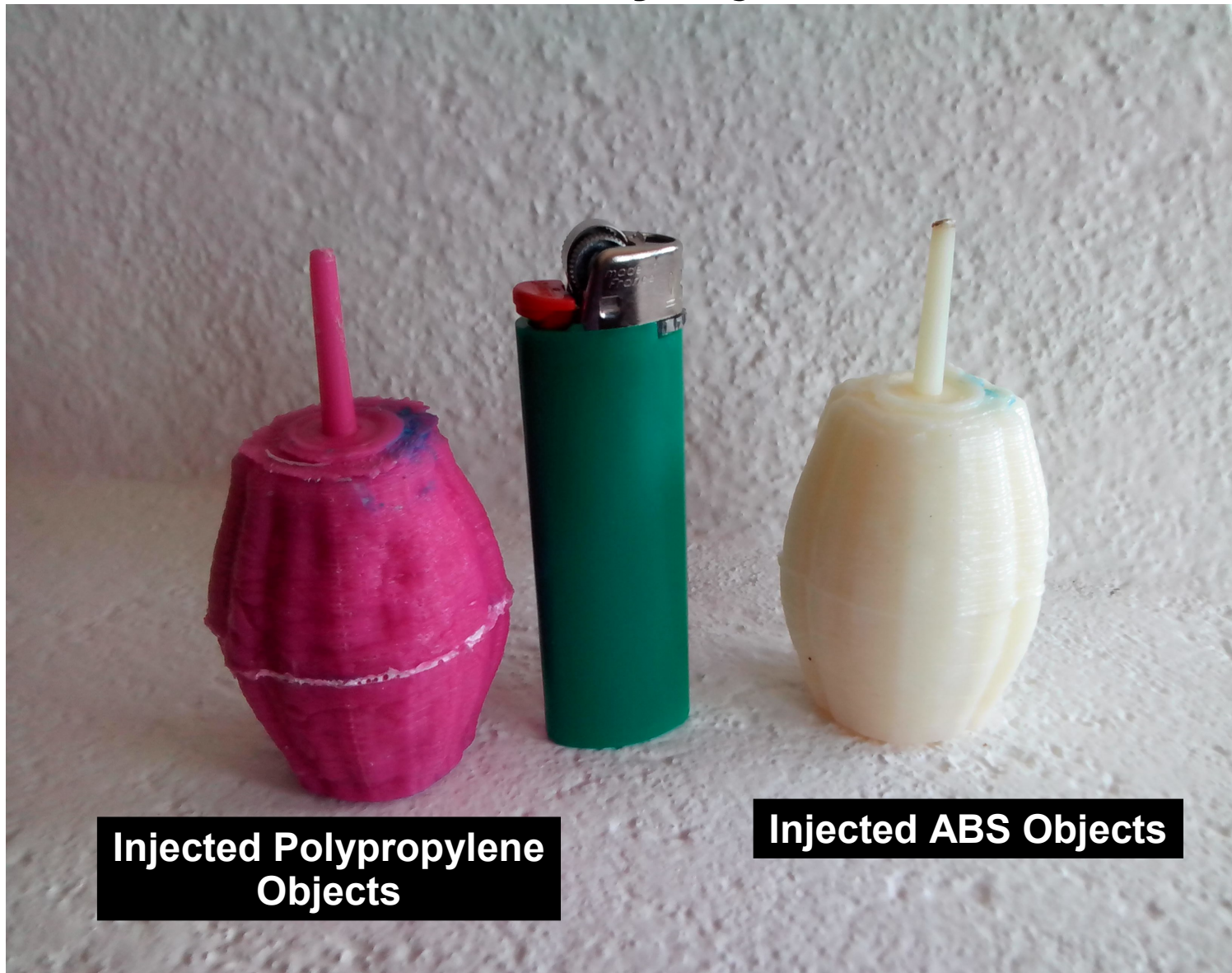
Injected Polypropylene Objects